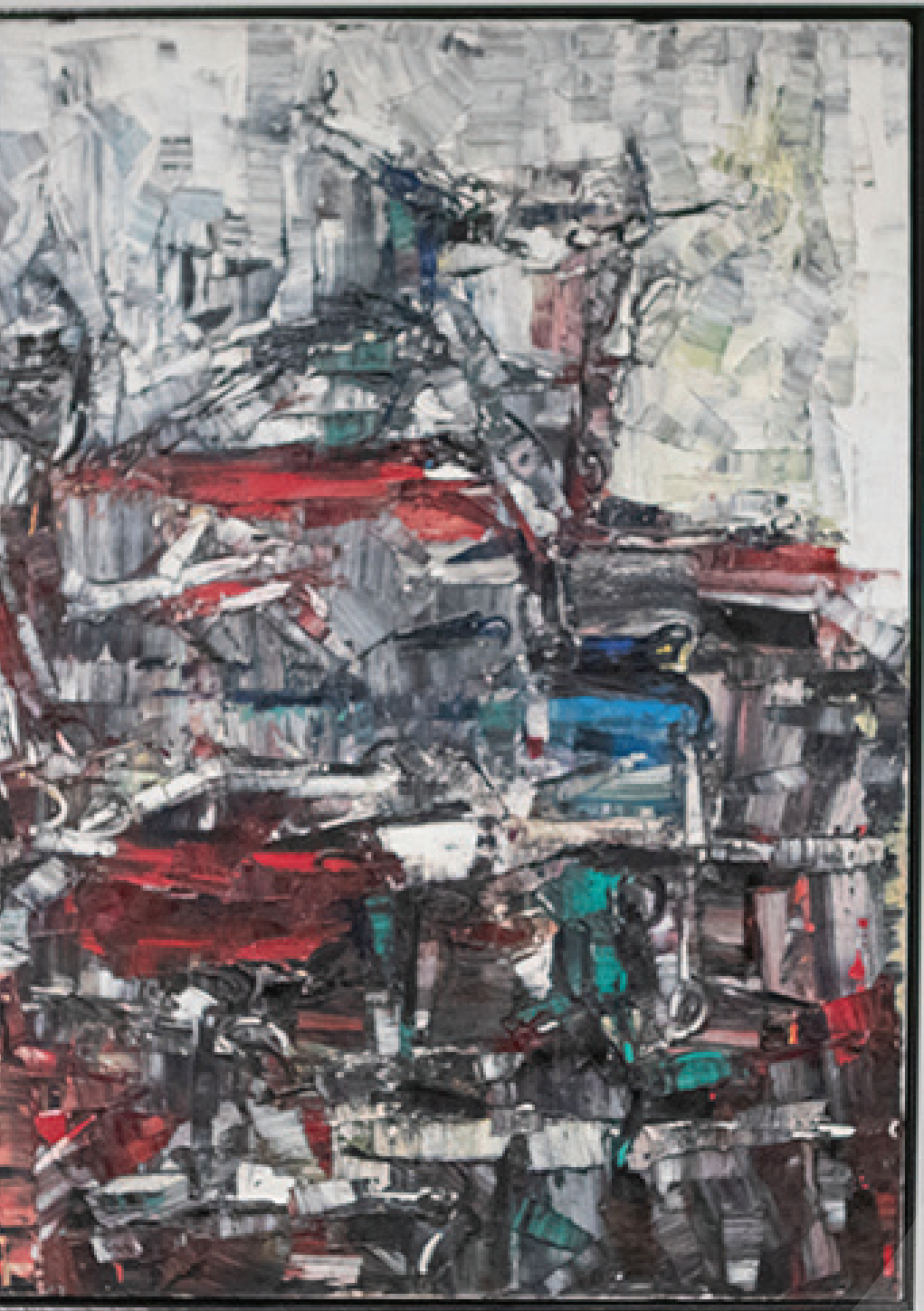
ARTIST'S NAME - YEAR TITLE MEDIUM