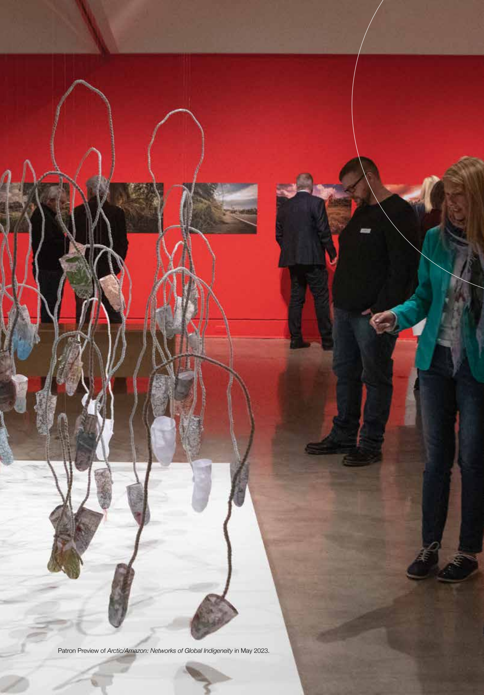
Patron Preview of Arctic/Amazon: Networks of Global Indigeneity in May 2023.