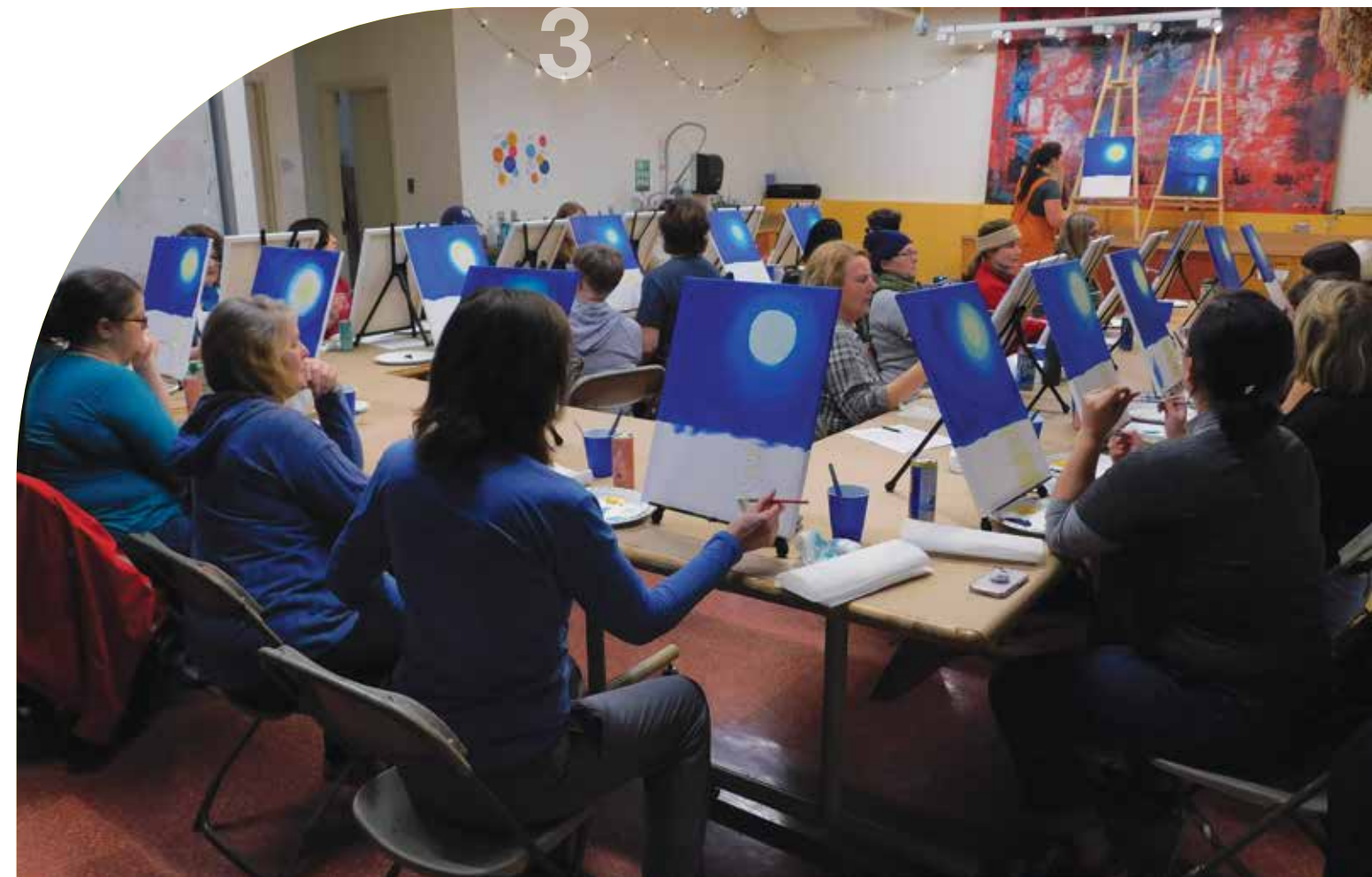
1 Guests participating in studio activities during Nocturne. 2 Halifax Chamber of Commerce Fall dinner. 3 Participants enjoying Painting & Pints workshops.